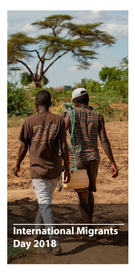
On 18 December, the world marks International Migrants Day.

"More than 60,000 migrants have died on the move since 2000... and behind every number is a person – a woman, a child, a man, who simply dream for what any of us dream – opportunity, dignity & a better life," said UNSG, António Guterres, speaking on the occasion of the adoption of the Global Compact on Safe, Orderly and Regular Migration (10 December 2018, Marrakesh, Morocco).