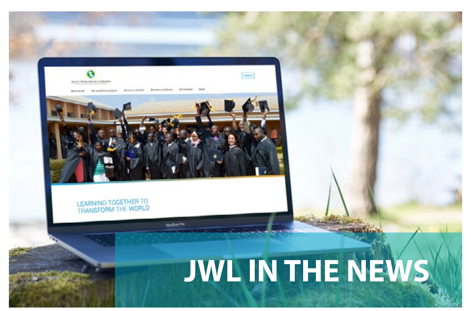
Have you been keeping up with us? To find our more about our work and our students, Click here! or connect with us on Facebook, Twitter, and Instagram. Check out our latest videos on our YouTube channel.