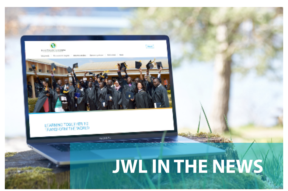
Have you been keeping up with us? To find our more about our work and our students, Click here! or connect with us on <u>Facebook</u>, <u>Twitter</u>, and <u>Instagram</u>. Check out our latest videos on our <u>YouTube</u> channel.