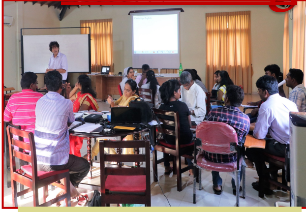
<u>Facilitator Training</u> -JWL Global English Programme

strategies in implementing the new text book 'English Unlimited'.