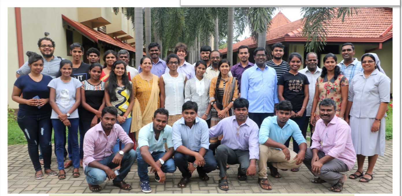
Entire Group of Facilitators, from 8 Centres (India & Sri Lanka), who attended the <u>Global English Training Programme</u> from 23rd- 26th July 2017