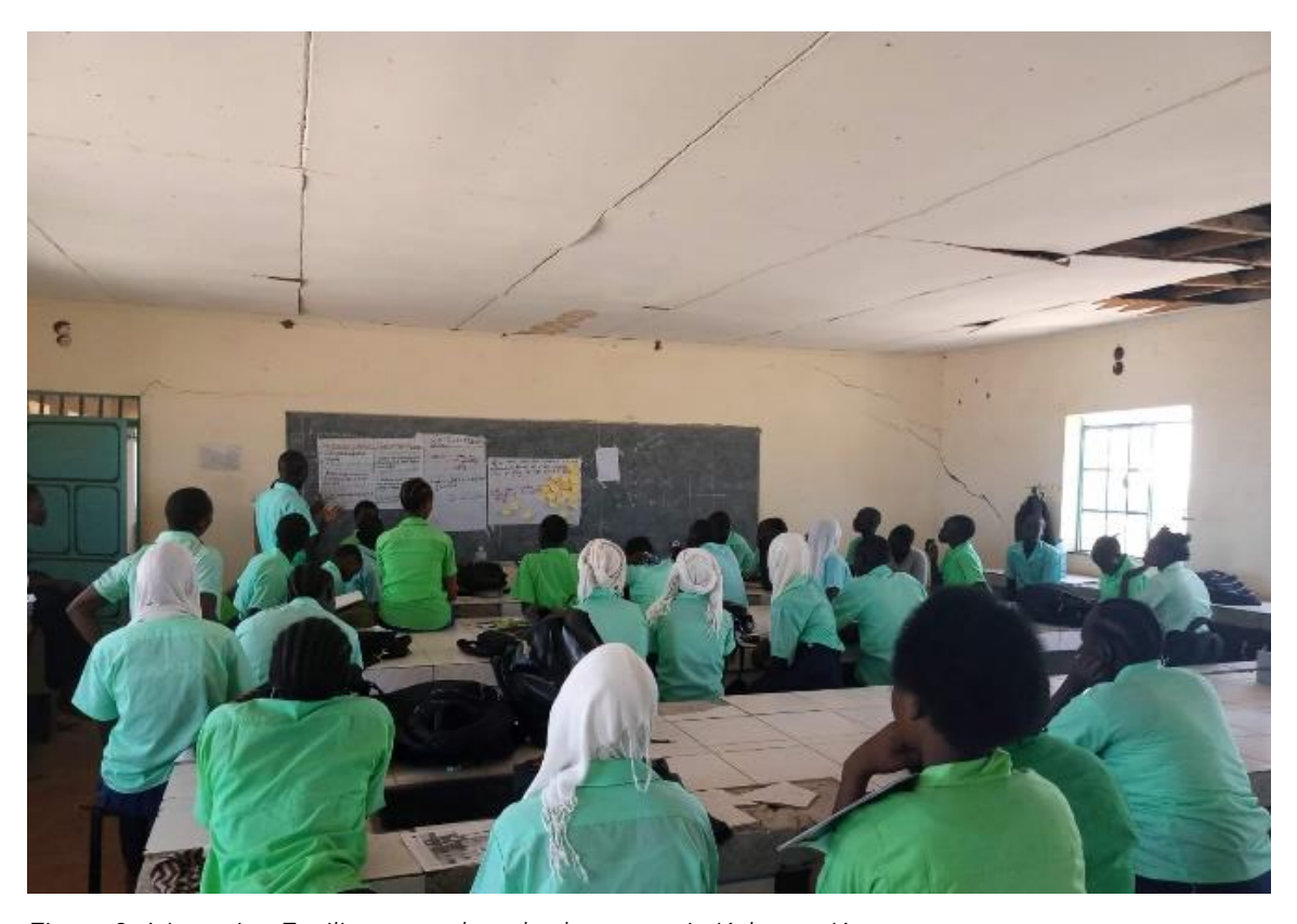
Figure 2: A Learning Facilitator graduate's classroom in Kakuma, Kenya

While graduates often engage in advocacy efforts to encourage female student access to education, they also serve as role models. In Afghanistan, this graduate highlighted their role as an example within the community, inspiring parents to send their daughters to school: