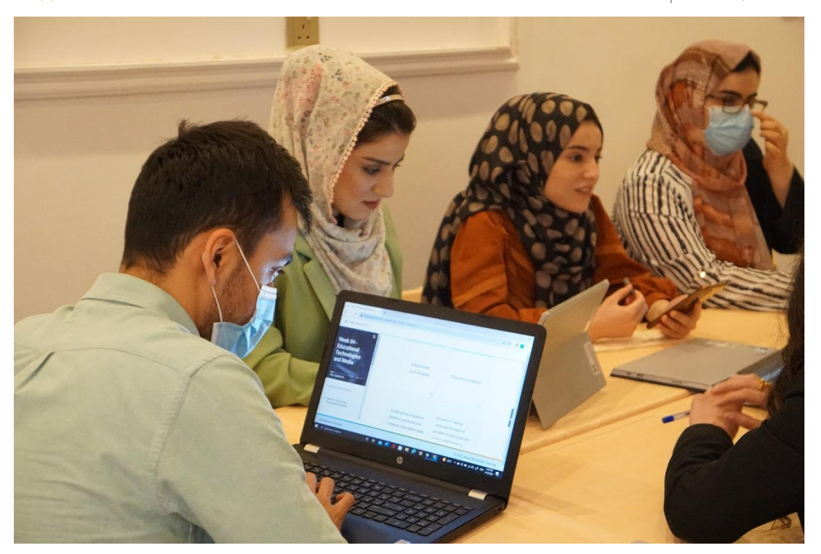
Figure 4: Learning Facilitator students in an onsite meeting in Erbil, Iraq

Other graduates cited building a code of conduct as part of fostering a supportive earning environment for their students. This graduate in Iraq explains how such tools are particularly helpful in their context as: