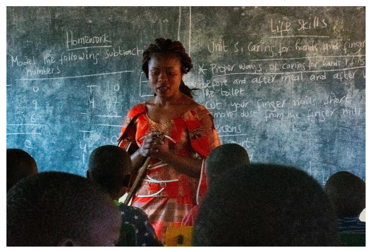
Figure 5: Learning Facilitator graduate teaching at a primary school in Malawi

The next section further discusses how the Learning Facilitator programme shapes graduates as servant leaders.