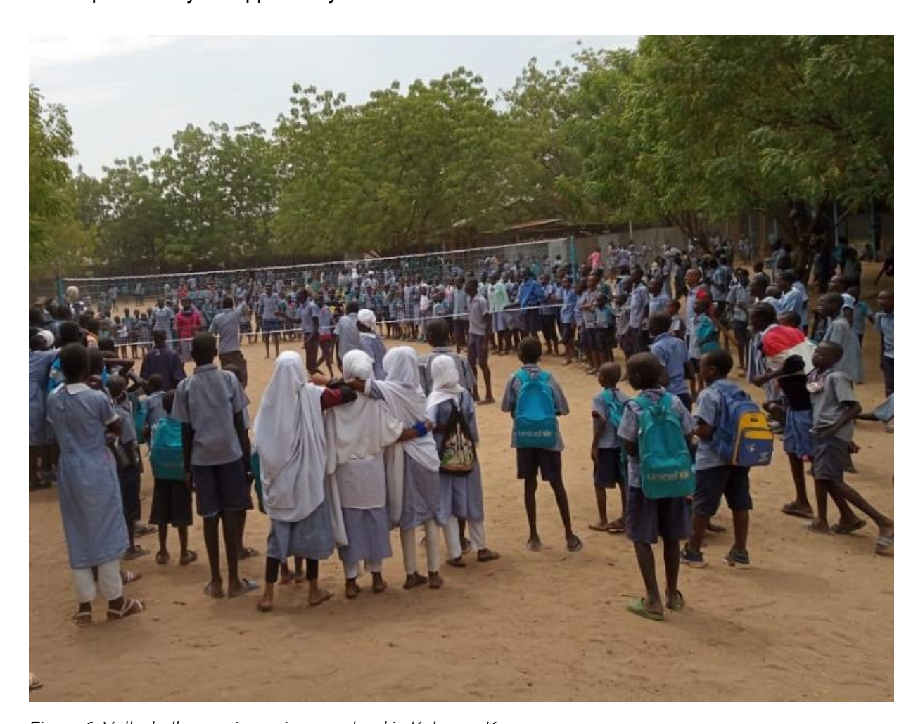
Figure 6: Volleyball game in a primary school in Kakuma, Kenya

Thus, graduates demonstrate а multifaceted approach to community engagement. viewing their roles as teachers as avenues to serve and with collaborate their communities, becomina effective transformative leaders. Their involvement encompasses various spheres of life, including family and community, as they actively take on leadership roles and contribute positively. This community engagement is not limited community-building initiatives; graduates also act as advocates, engaging in constructive dialogues with relevant authorities to promote inclusive education and community development.