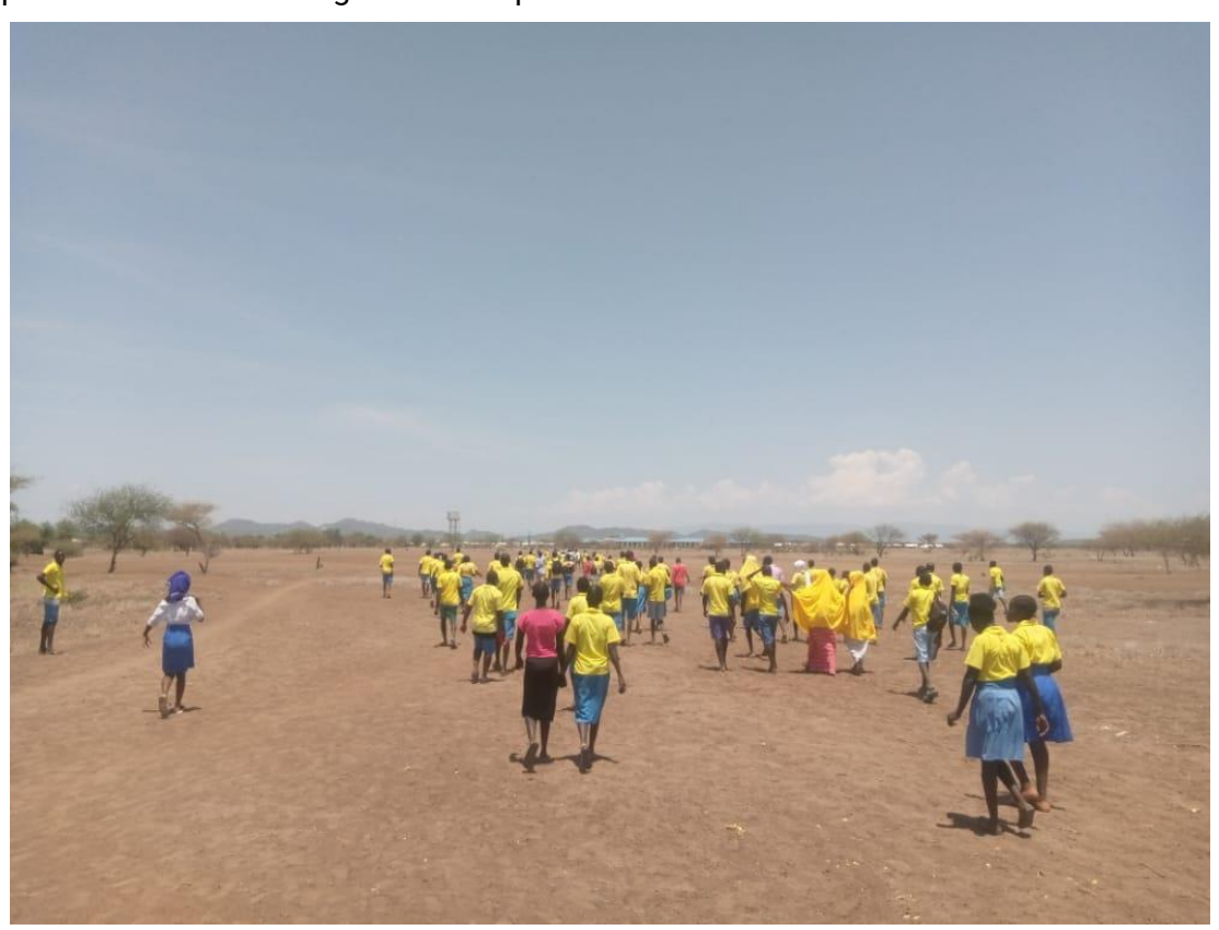
Figure 3: Learners on their way back from school in Kakuma, Kenya

As a result, when speaking with community members, their words are held as credible and often accepted without hesitation.