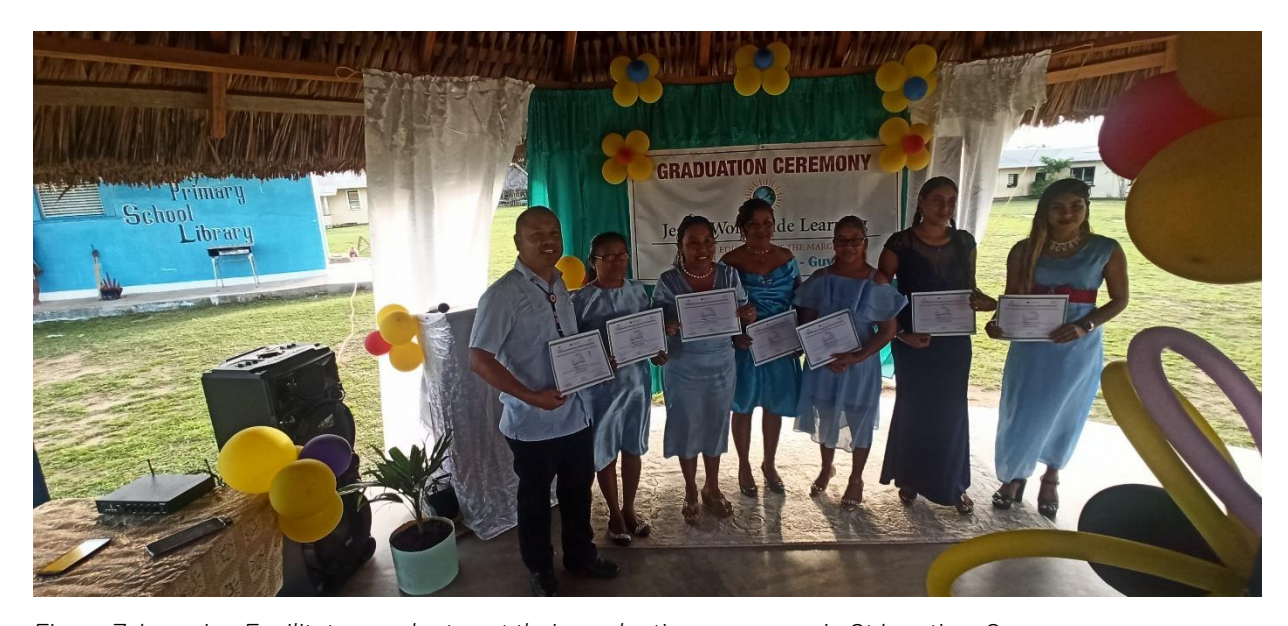
Figure 7: Learning Facilitator graduates at their graduation ceremony in St Ignatius, Guyana

In conclusion, the Learning Facilitator enabled programme graduates experience personal empowerment not only through financial growth and skillbuilding, but also through education. As teachers, graduates transfer this empowerment to the whole community. Their dedication to volunteering, taking on leadership roles, and challenging cultural norms exemplifies their commitment to community development and transformation. Their willingness to collaborate and make a positive impact demonstrates how the programme equips graduates to become strong advocates for community development through education.