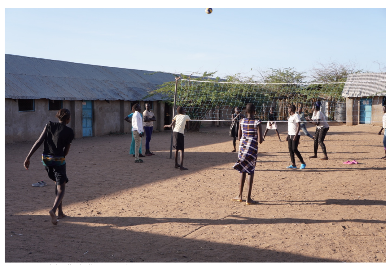
Figure 5: Girls' volleyball team, Kakuma, Kenya

Therefore, as graduates build their leadership skills, they become role models within their community, empowering youth to not only join sports initiatives but also encouraging them to pursue their studies and focus on their future. Coaching skills developed during the course instrumental in solving issues faced by the community and addressing diverse needs. This impact on the community is not without consequences for graduates themselves, as this growth in existential competences boosted their selfconfidence.