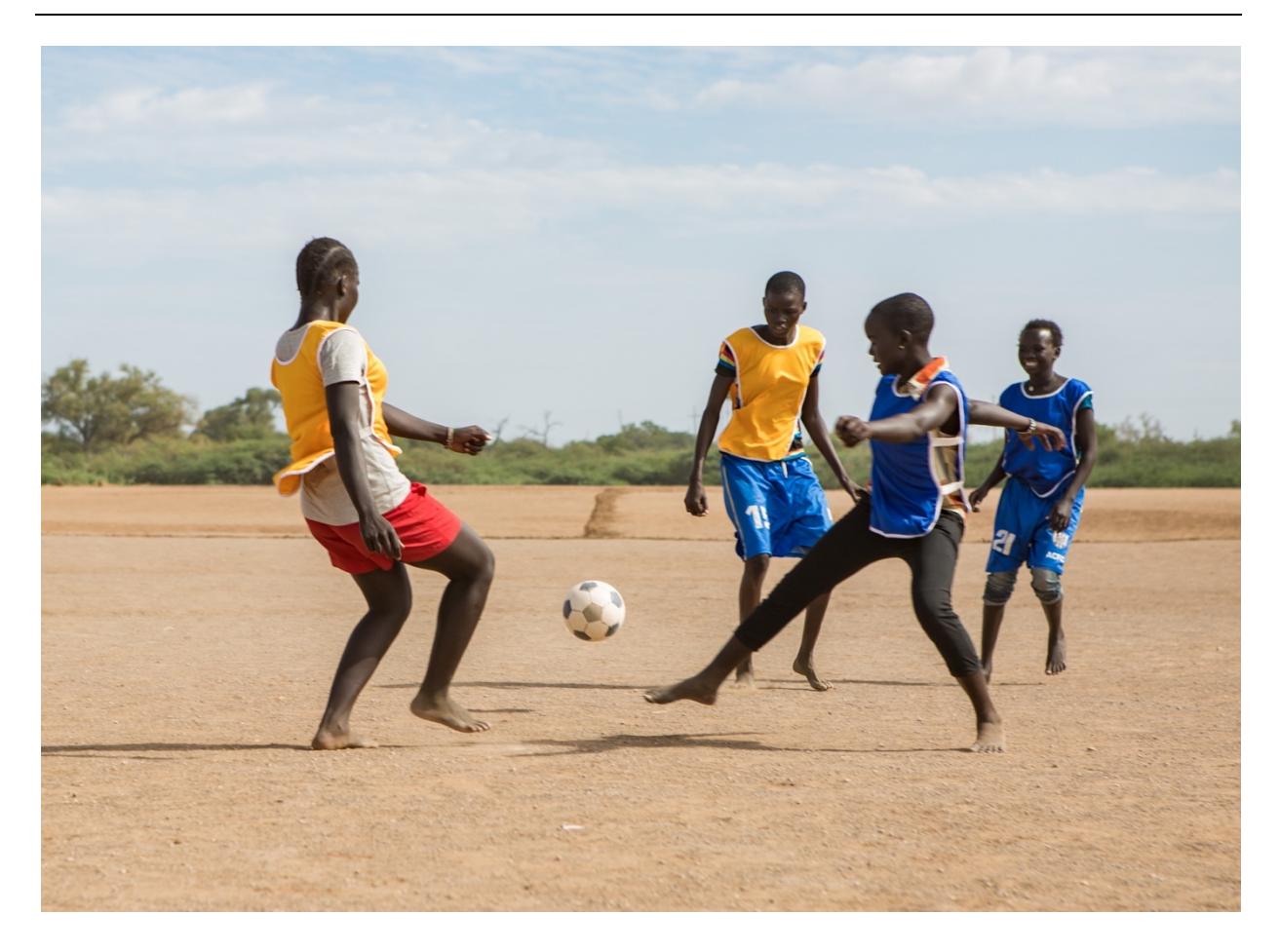
Figure 3: Youth playing football in Kakuma Camp, Kenya