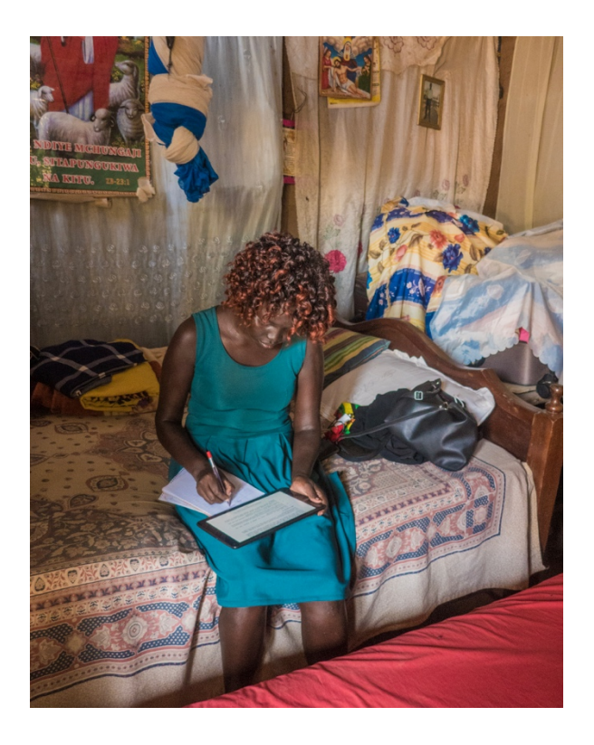
Figure 6: YSF student studying at home in Kakuma Refugee Camp, Kenya

become aware of how sport is and how sport can be managed and how sport can be learned, how a coach can deal with players, so empowerment is when you get something in order to help other people or example you didn't have a knowledge the knowledge and help people to become aware of who what they are what they can do or make them proud they can proceed in achieving what they want to achieve." (MD_YSF_G5_P)