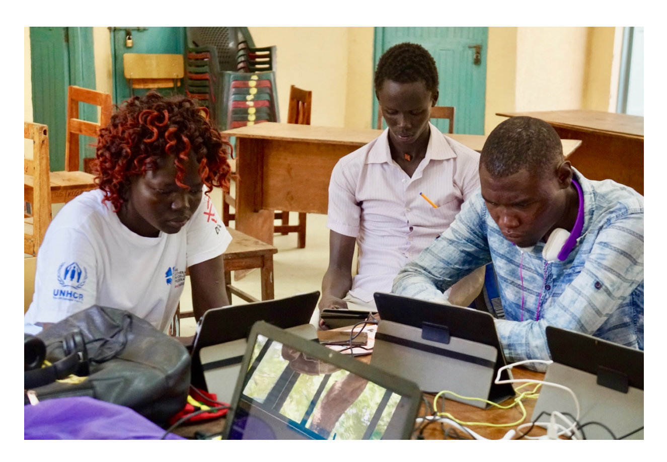
Figure 4: Youth Sports Facilitator onsite meeting, Kakuma, Kenya

graduates often apply their critical thinking and entrepreneurial skills, taking up advocacy roles and actively engaging with their communities to change customs with a view to promoting greater social inclusion and cohesion through sports.